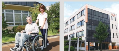
Nagaoka Children's Welfare College Department of Care welfare