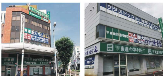
Front of Nagaoka Station School • East of Nagaoka Station School