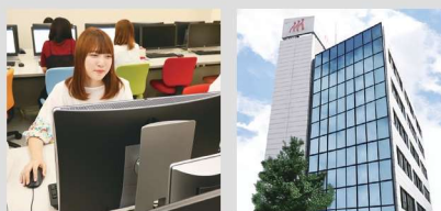
Japan Business Civil Service College

Others University Professional training college (Vocational school)