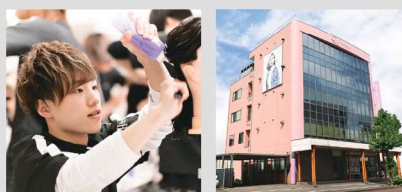
CREA Hair Mode vocational school